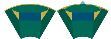
Figure 1: Original (left) and optimized (right) design of a rotor of a permanent magnet synchronous machine using nominal optimization [2].

Prof. Dr. Sebastian Schöps schoeps@temf.tu-darmstadt.de Office: S2|I7 29